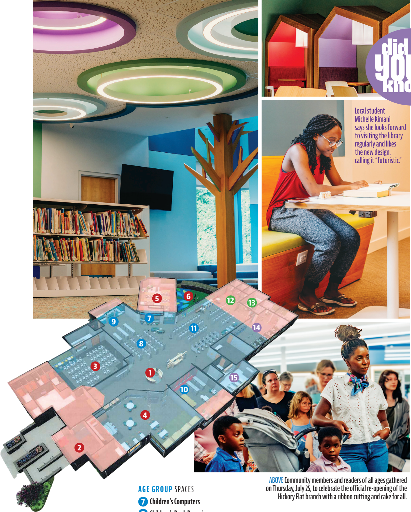
ABOVE Community members and readers of all ages gathered on Thursday, July 25, to celebrate the official re-opening of the Hickory Flat branch with a ribbon cutting and cake for all.